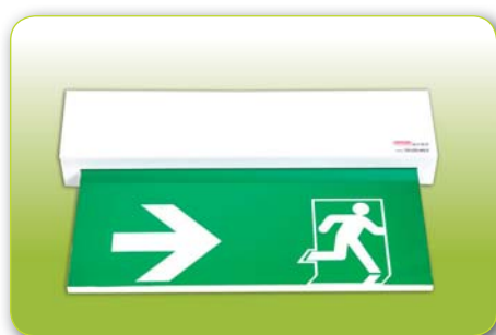
"CRYSTALITE" Cat. CX-LED-405-P