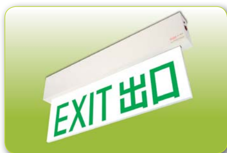
"CRYSTALITE" Cat. CX-LED-570-P